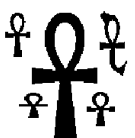
Figure C.3: AAAAA