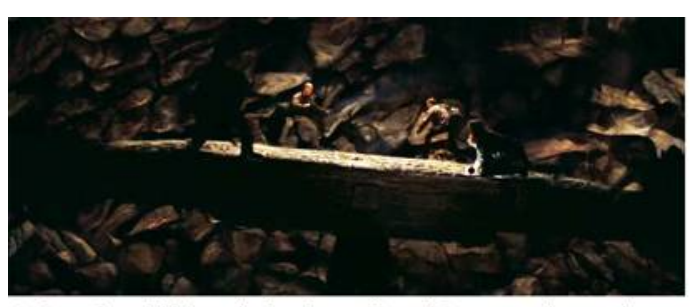
A plane of equal thickness is placed on a pillar and four persons jump on it.

Like the film there are four people in the group and to reach the treasure they have to jump on a plate that is placed on a pillar with sharp edge at the top. Before any of them jumps on the plate, it is in a stable position. For simplicity you can assume that the plate is rectangular in shape, has equal thickness at all places, it is solid and made of same material. Four people of equal weight jump on the plate at the same time but they can jump only at some certain points of the plate. So they cannot always jump in such a way that the plate is stable after they jump on it. Therefore after