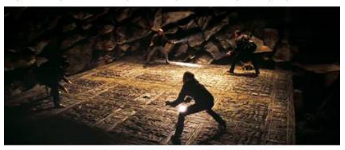
They run to change their position and keep the plane balanced.

jumping on the plate they must run and change their position to make the plate stable again.