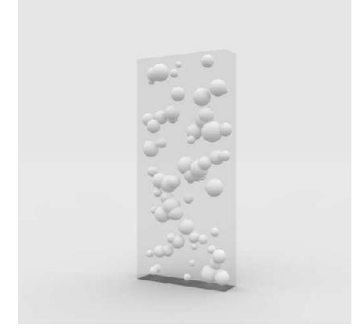
Figure 12: A strange object

In the year 2xxx, an expedition team landing on a planet found strange objects made by an ancient species living on that planet. They are transparent boxes containing opaque solid spheres (Figure 12). There are also many lithographs which seem to contain positions and radiuses of spheres.